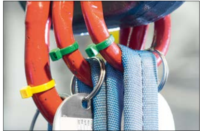
T-Series cable ties – ideally suited for colour coding.