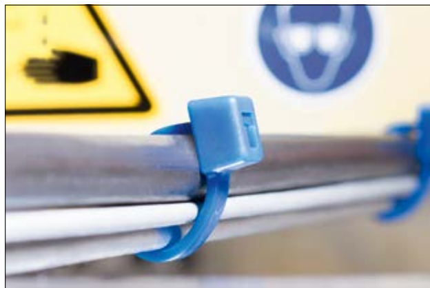
T-Series E/TFE cable ties – for higher chemical resistance up to +170 °C.