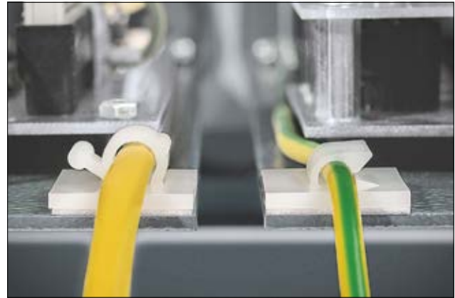
Self adhesive one piece fixing mounts RA6 (l) and RB5 (r).