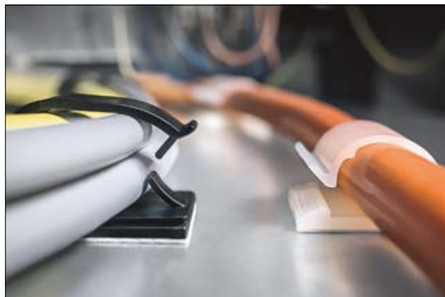
Self adhesive one piece fixing mounts RB20 (l) and RB14 (r).