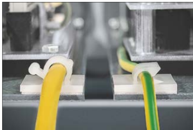
Self adhesive one piece fixing mounts RA6 (l) and RB5 (r).