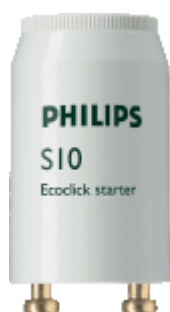
STARTER S10 EUR