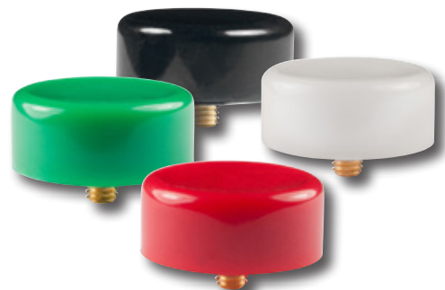
Changes to AT412 Caps in Underside Structure and Material

Effected standard part numbers are listed on the table on page 2.