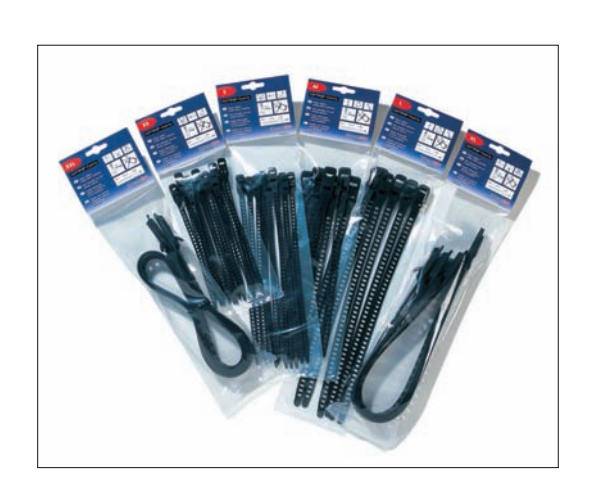
SRT ties available in small quantities.