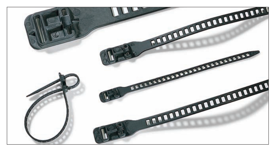
The Elasticity of the SRT ties makes them suitable for use in many applications.

The SRT range offers solutions to numerous bundling applications. The soft, flexible material makes these ties particularly suitable for use on data and fibre-optic cables. The elasticity of the material makes them ideal for securing young trees to support poles, and other applications within the gardening and landscaping industry.