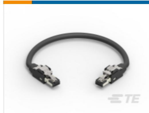
TE Part # 1-2300160-1 CA IND RJ45STR 8POS