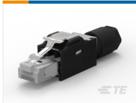
TE Part # 2120892-1 RJ45 CONNECTOR CAT6A, IP20 PLUG