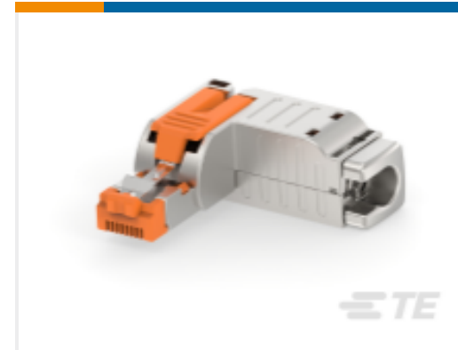
TE Part # 2383217-1 RJ45 FIELD INSTALLABLE CABLE CONN. 90