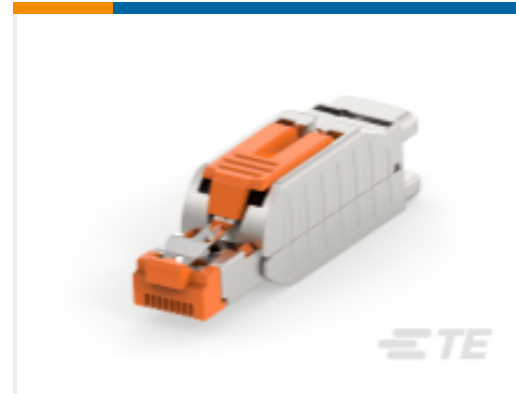
TE Part # 2383216-1 RJ45 FIELD INSTALLABLE CABLE CONN.