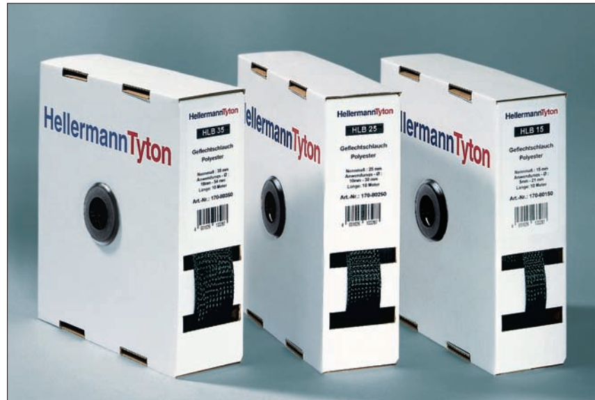
Helagain HLB: The expansion rate makes it possible. Only three sizes in a handy dispenser box for almost all standard diameters.

The fraying of the sleeving can be prevented with the HSG0 hot cutting tool. You can find more information to the HSG0 hot cutting tool in chapter 6.3