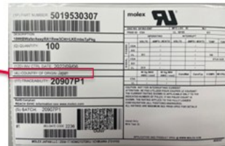
Carton label (sample image)