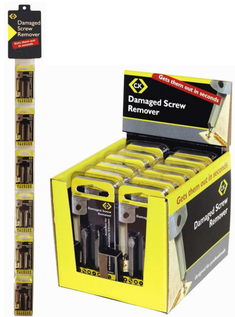
Clip strip and counter box