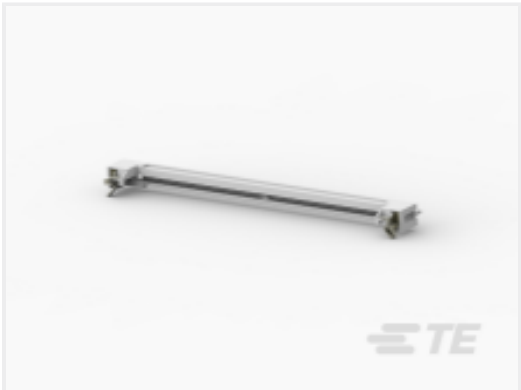
TE Part #5822032-4 72 ME .050 VERT AU M/L PB-FREE