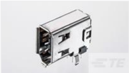
TE Part #5787956-1 SOCKET ASSY IEEE1394