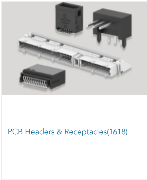
PCB Headers & Receptacles(1618)