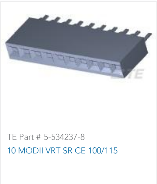
TE Part # 5-534237-8 10 MODII VRT SR CE 100/115