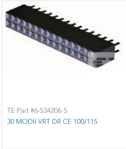
TE Part #6-534206-5 30 MODII VRT DR CE 100/115