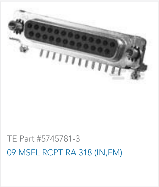
TE Part #5745781-3 09 MSFL RCPT RA 318 (IN,FM)