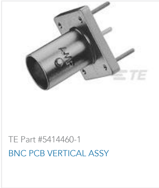
TE Part #5414460-1 BNC PCB VERTICAL ASSY