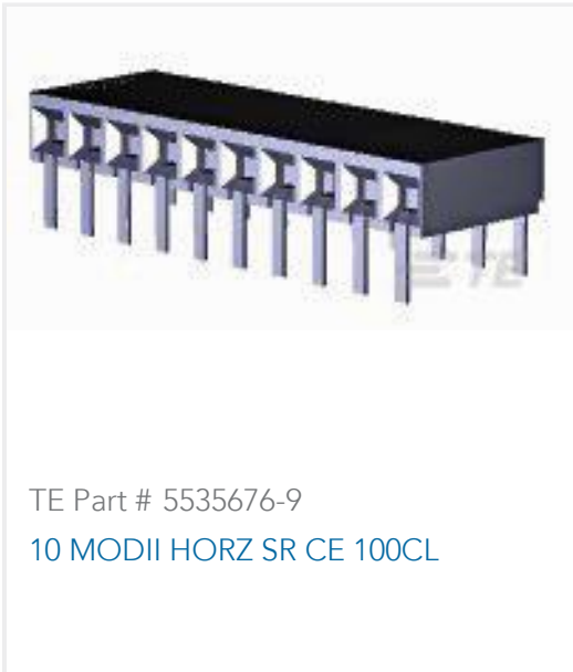
TE Part # 5535676-9 10 MODII HORZ SR CE 100CL