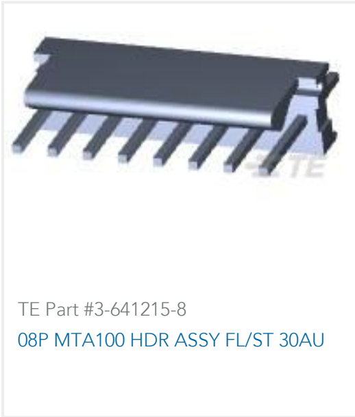
TE Part #3-641215-8 08P MTA100 HDR ASSY FL/ST 30AU