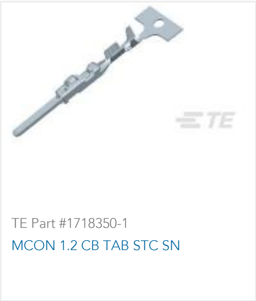
TE Part #1718350-1 MCON 1.2 CB TAB STC SN