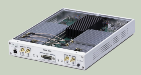
Image of two TwinRX daughterboards inside a USRP X Series motherboard connected with LO sharing cables