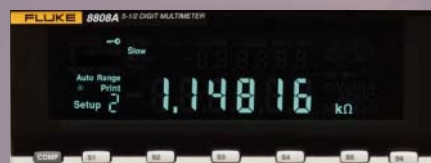
Set up six common measurements via the front panel buttons, then simply press the appropriate key to perform each one.