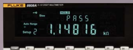
The limit compare mode with pass/fail indicators can help you eliminate production mistakes.