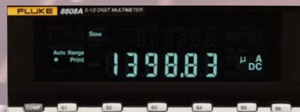
The 8808A can measure small leakage currents with a resolution of up to 100 nA, without loading the circuit under test.