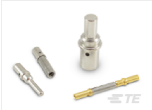
TE Part #CAT-D48-ST273 DEUTSCH Solid Contacts