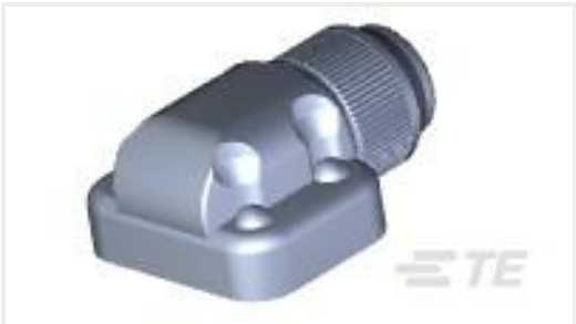
TE Part #1674320-1 ENCODER CABLE I/O KIT, MICRO M