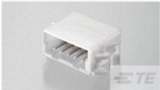
TE Part #292254-3 CT RELAY HDR ASSY 3P NAT