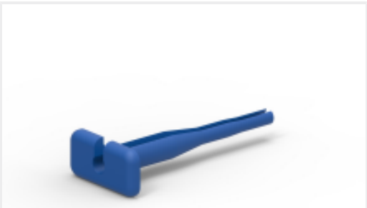
TE Part #0411-310-1605 EXT TOOL, SIZE 16, 16-18 AWG, T, LT BLU