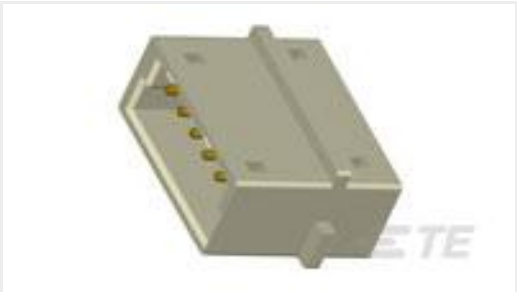
TE Part #292156-3 CT RELAY HDR ASSY FREE HANGING