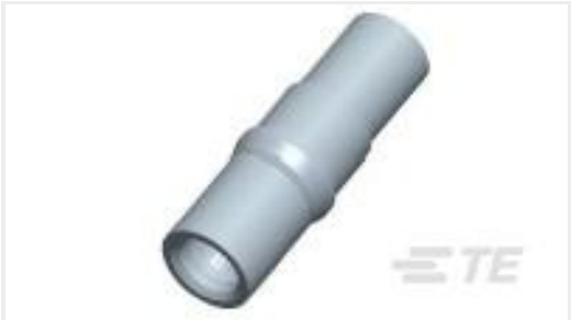
TE Part #1871132-3 DYNAMIC D7 SOCKET CONT ASSY AG PL #10-12