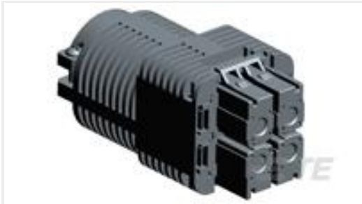
TE Part #1-2069313-1 D-7 DYNA-CLAMP D-7100 REC 4P KIT M XX