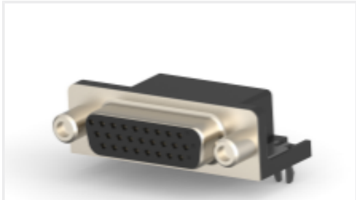
TE Part #2311768-2 AMPL REC, HD22, R/A, 26P, S/L