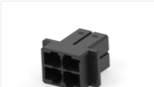
TE Part #CAT-D9934-A86A Receptacle and Tab Housing: 16 mm Pitch, 630V