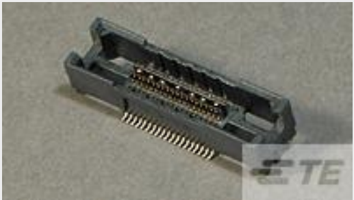
TE Part #2-5767004-2 MICTOR RECEPT ASSY, 38 POS.