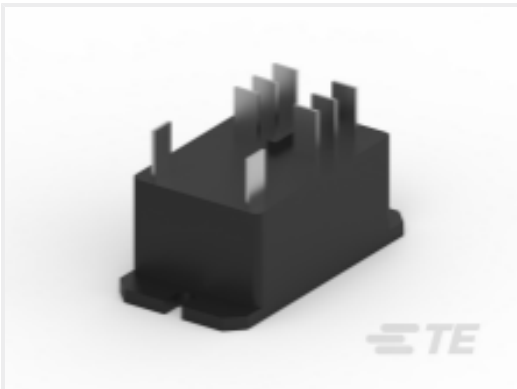
TE Part #4-1393211-2 T92P11A22-208