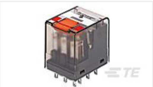
TE Part #2-1415529-1 PT320615