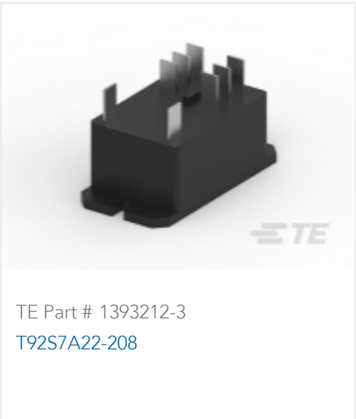
TE Part # 1393212-3 T92S7A22-208