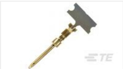
TE Part #6-66506-1 20 DF PIN CONT, SMALL PACK