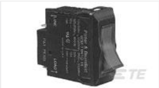
TE Part #4-1393248-2 W33-T4B1Q-10=W33