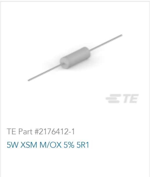
TE Part #2176412-1 5W XSM M/OX 5% 5R1