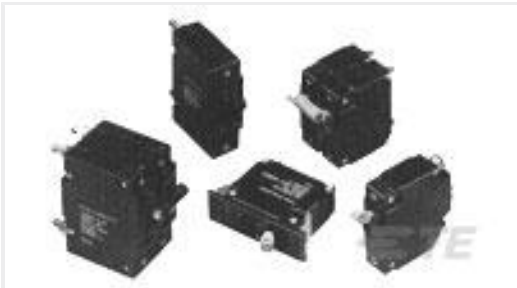
TE Part #2-1393254-7 W91-X112-3=M6/M7/M9/W6/W7