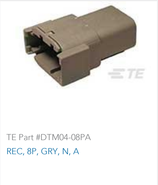
TE Part #DTM04-08PA REC, 8P, GRY, N, A