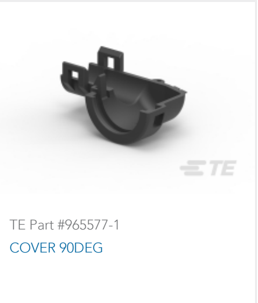
TE Part #965577-1 COVER 90DEG