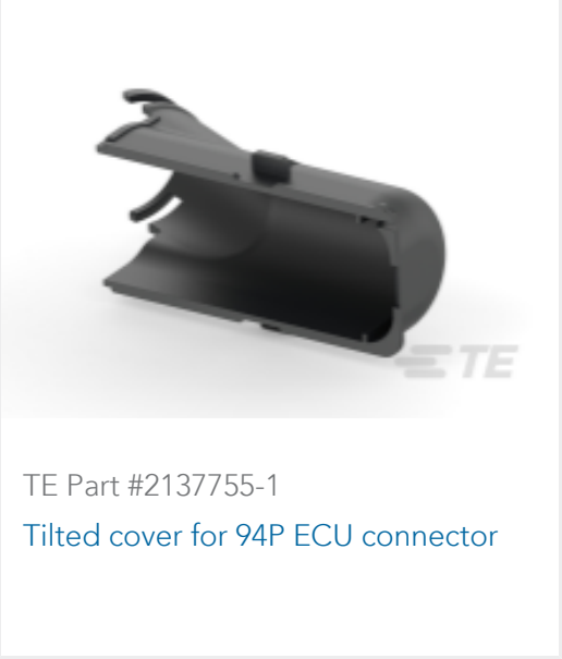
TE Part #2137755-1 Tilted cover for 94P ECU connector