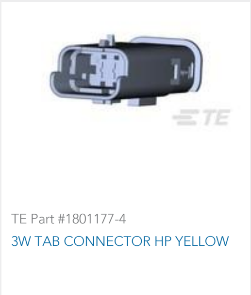
TE Part #1801177-4 3W TAB CONNECTOR HP YELLOW