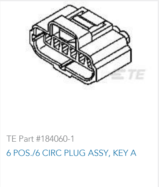
TE Part #184060-1 6 POS./6 CIRC PLUG ASSY, KEY A