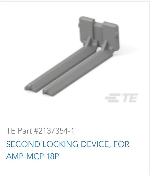
TE Part #2137354-1 SECOND LOCKING DEVICE, FOR AMP-MCP 18P