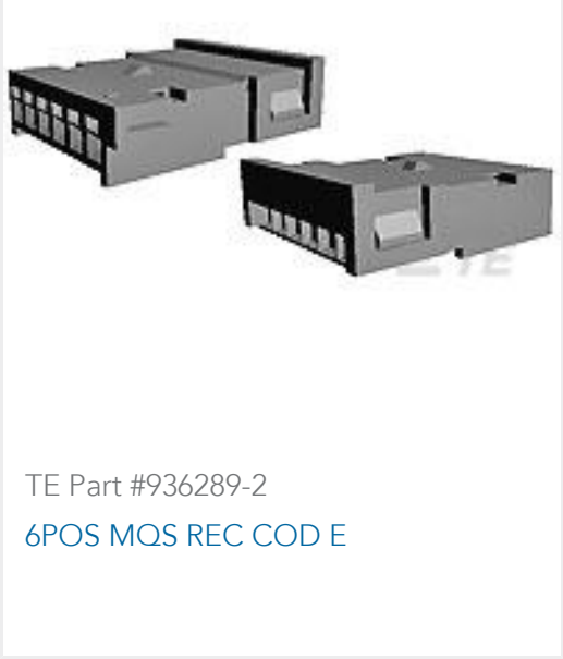
TE Part #936289-2 6POS MQS REC COD E