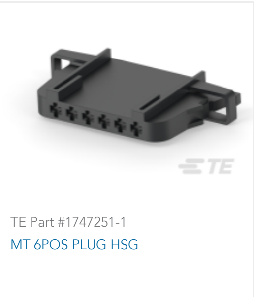
TE Part #1747251-1 MT 6POS PLUG HSG