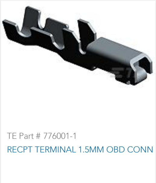
TE Part # 776001-1 RECPT TERMINAL 1.5MM OBD CONN