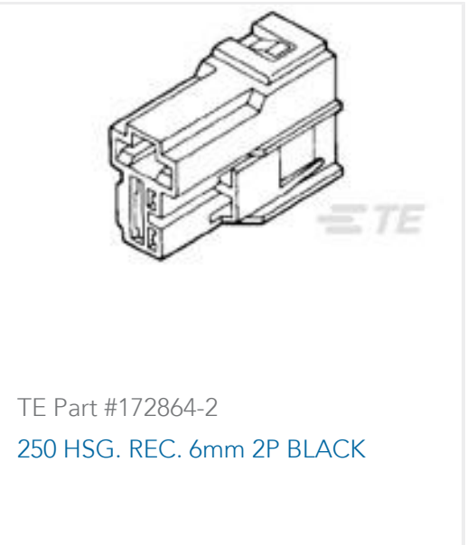
TE Part #172864-2 250 HSG. REC. 6mm 2P BLACK