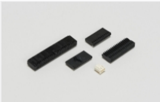
Wire-to-Board Connector Assemblies & Housings(134)