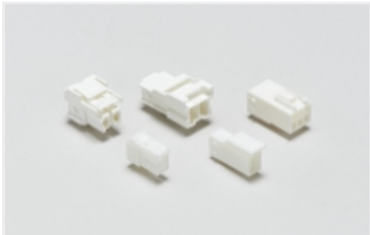
Rectangular Power Connectors(224)