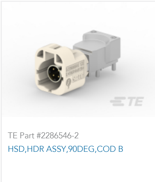
TE Part #2286546-2 HSD,HDR ASSY,90DEG,COD B