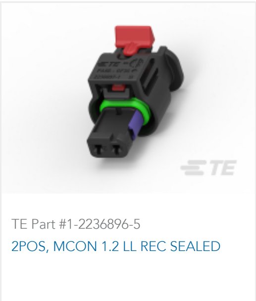
TE Part #1-2236896-5 2POS, MCON 1.2 LL REC SEALED