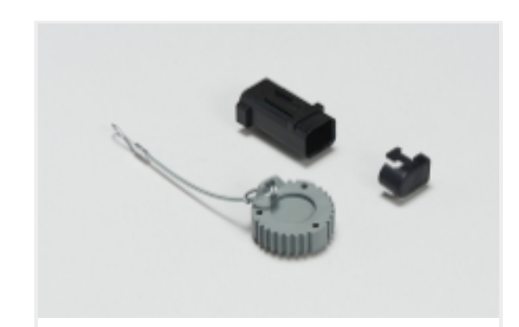
Automotive Connector Caps & Covers (2)