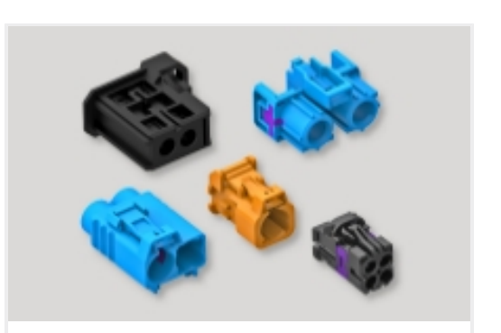
Data Connectivity Housings(525)