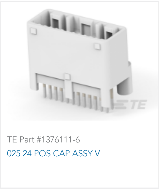
TE Part #1376111-6 025 24 POS CAP ASSY V