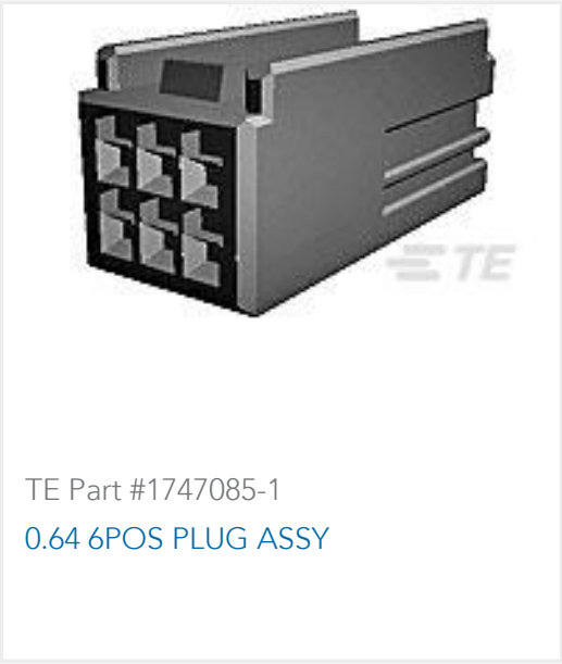
TE Part #1747085-1 0.64 6POS PLUG ASSY