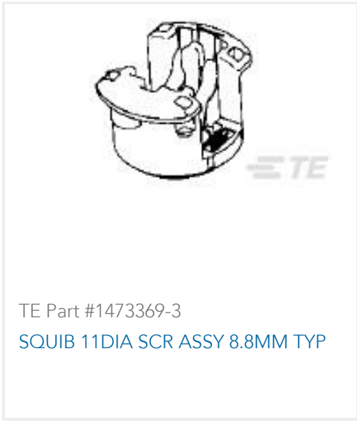
TE Part #1473369-3 SQUIB 11DIA SCR ASSY 8.8MM TYP