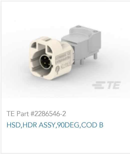
TE Part #2286546-2 HSD,HDR ASSY,90DEG,COD B