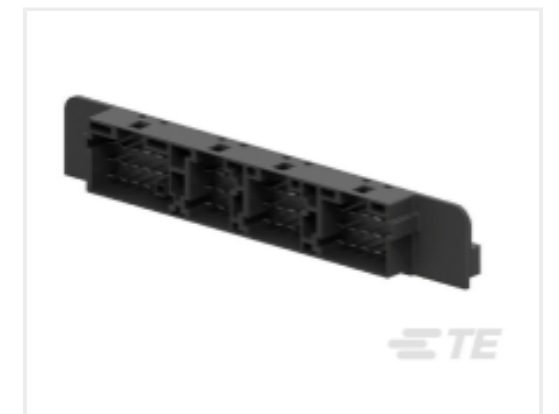
TE Part #CAT-HPCH5372 High Pin Count Header