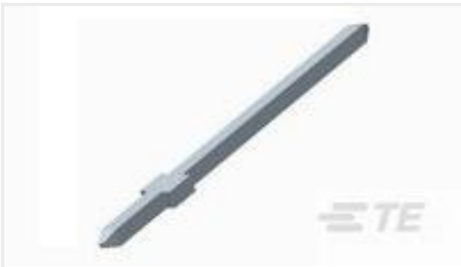
TE Part #2-928776-3 MOD2 STIFT M A-PIN