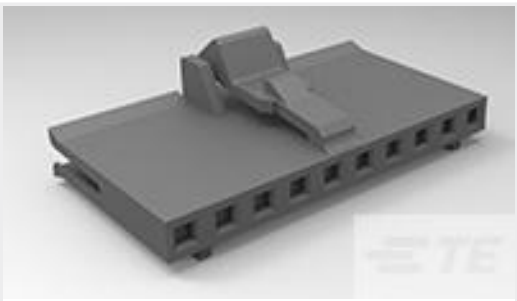
TE Part # 1-487526-8 019 HOUSING FFC RCPT 100CL SR