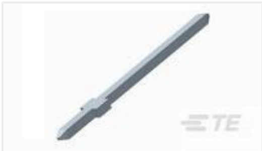
TE Part #3-928776-4 MOD2 STIFT M A-PIN