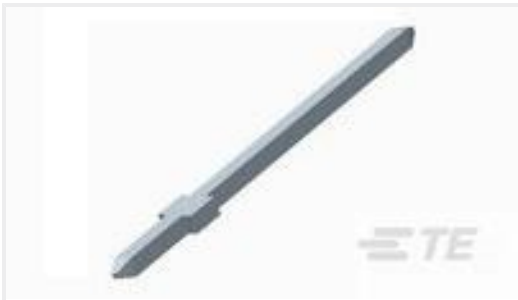
TE Part #3-928776-2 MOD2 STIFT M A-PIN