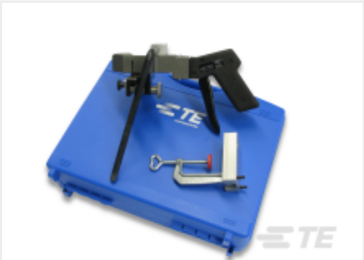
TE Part # 1-528013-1 FFC PISTOL GRIP HAND TOOL CASE