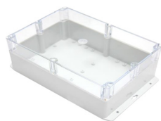
Plastic Enclosure, Light grey Base