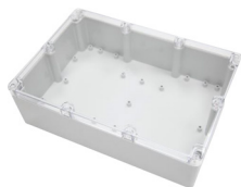
Plastic Enclosure, Dark grey Base