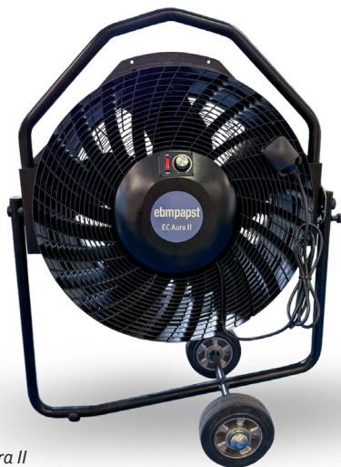
EC Aura II

Circulating fan offering an energy efficient low noise solution to traditional temporary cooling solutions.