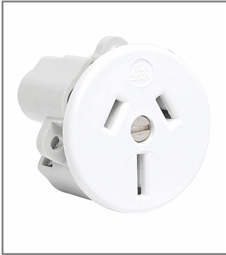
15 Amp plug base - 38/15