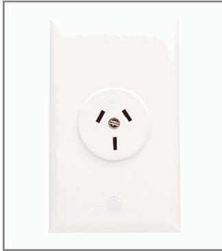
10 Amp plug base on plate - 38/1