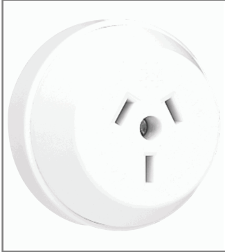
Single 3 pin flat surface base - Cat 35

Single bases available: 3 pin flat - 10A clear, white, brown and black; 3 pin round earth - 10A