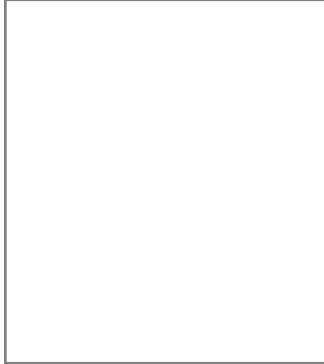
Single clear plugbase - Cat 37CL, 37/15CL