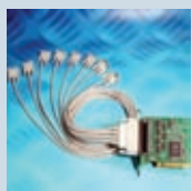
UC-279: uPCI 8xRS232