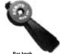
Bar knob, 4.75" long

Any knob can be used with any rheostat and tap switch model which has the corresponding shaft diameter. Knobs are fastened to shafts with slotted set screws.