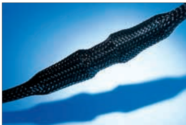
Helagaine HEGP braided sleeving.

For more information on the HSG0 hot-cutting tool, please turn to page 274.