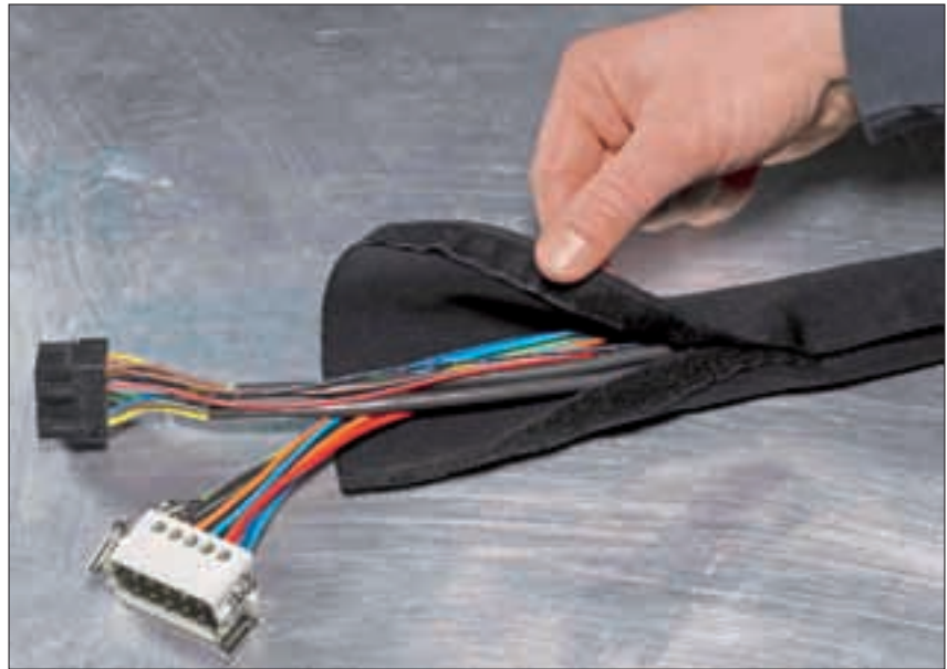
HELAHOOK protective sleeving allows for retrospective fitting and repeated use.

HELAHOOK is also employed in automobiles or commercial vehicles. It is the ideal solution for post-termination cable organisation and wherever repeated use is a necessity.