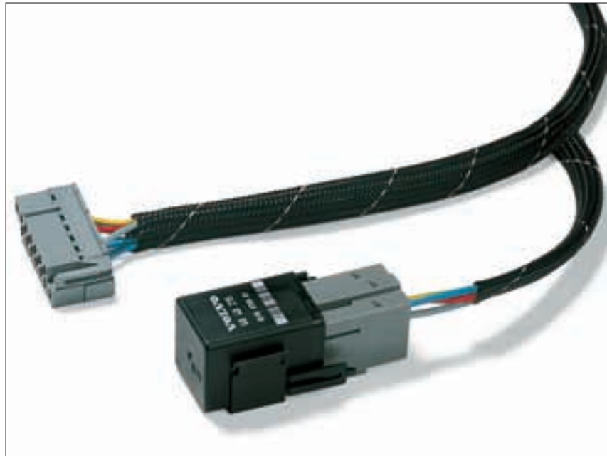
Helagaine HEGPV0X braided sleeving.

To prevent fraying, the sleeve is cut with a hot-knife, which melts and cleanly fuses the ends of the yarn.