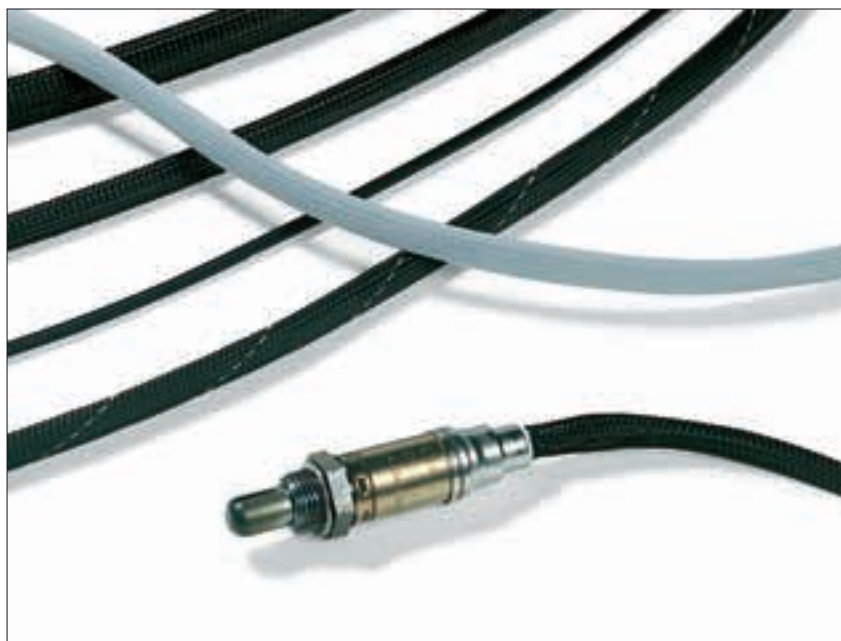
Various types of Helagain braided sleeving.

Fraying of the braided sleeving can be avoided by using a hot-knife to cut the sleeving. Braided sleeving can also be supplied in pre-cut lengths on request.