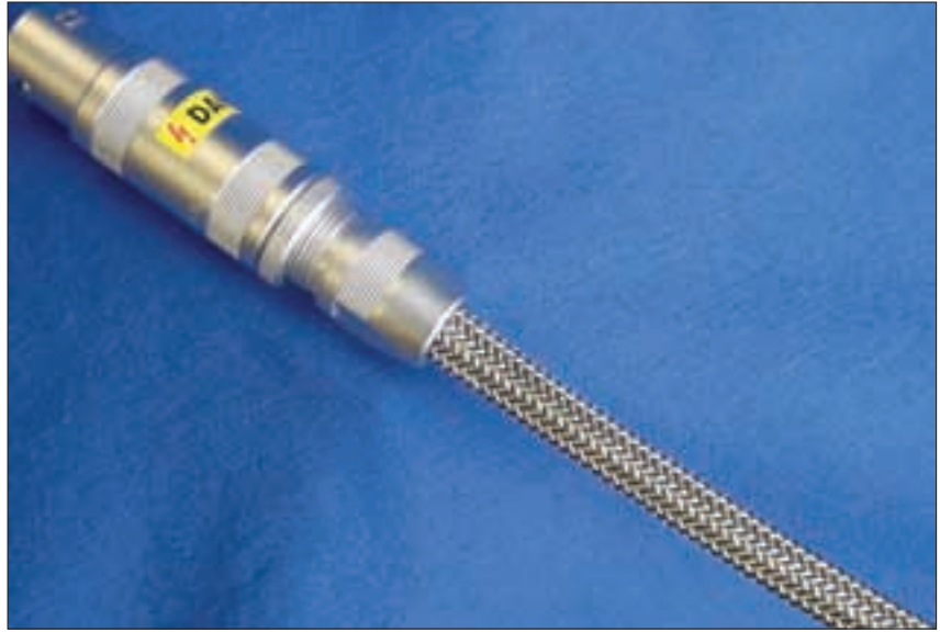
Helagaine HEGEMIP braided sleeving is made of tin-plated copper and polyester yarn.

Helagaine EMI braided sleeving is used for highly sensitive electronics, such as electrical appliances and machines, radio equipment and automobiles.