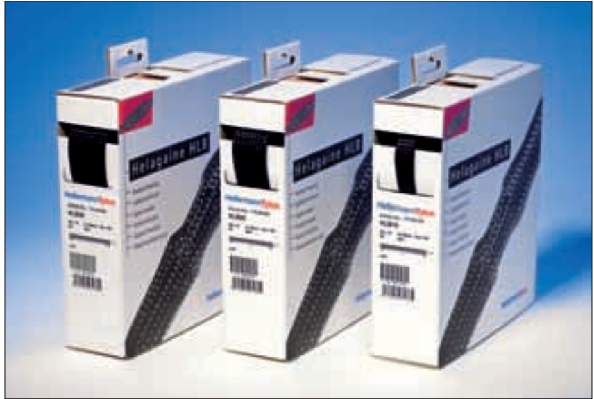
Helagaine HLB: The expansion rate makes it possible. Only three sizes in a handy dispenser box for almost all standard diameters.

To prevent fraying, the sleeve is cut with a hot-cutting tool, which melts and cleanly fuses the ends of the yarn