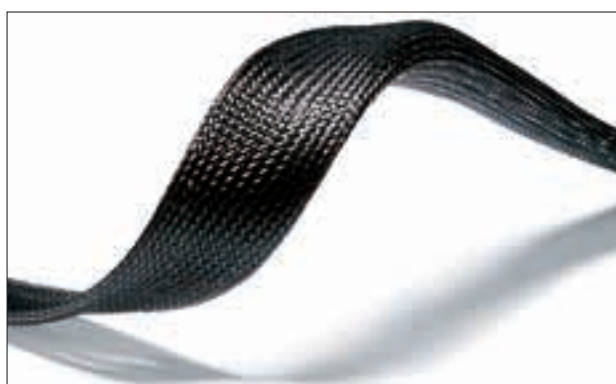
Helagaine HEGPX braided sleeving.