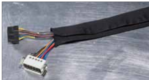
HELAHOOK provides excellent abrasion resistance.