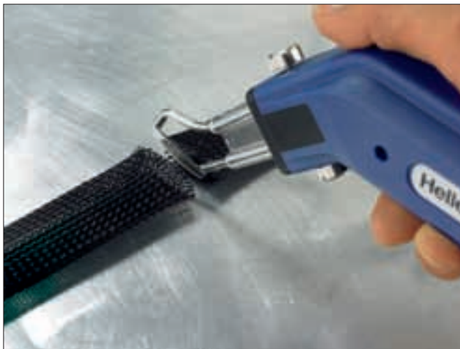
The HSG0 hot cutting tool prevents the braided sleeving from fraying.

The HSG0 hot cutting tool is a light, robust, hand-held device to cut synthetic fabrics such as braided sleeving. It heats up quickly with the press of a button and cuts the sleeving cleanly in a matter of seconds. The individual strands melt and fuse together, preventing the sleeving from fraying.