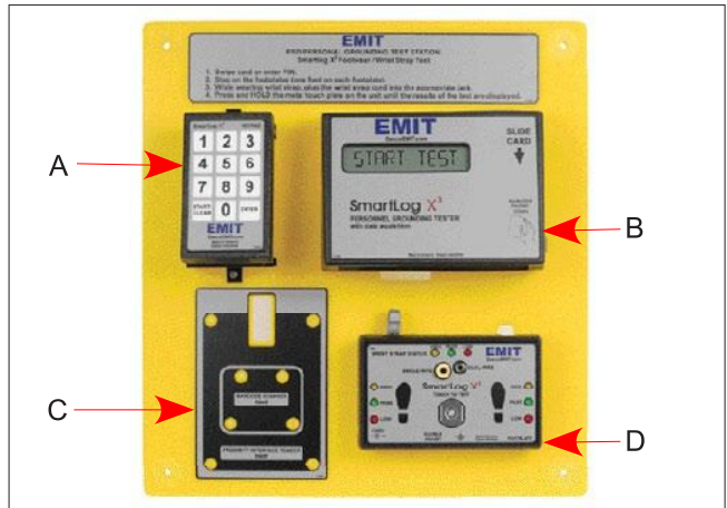
Figure 2. SmartLog X 3 ™ features and components (Items 50730, 50731, 50732, 50733)