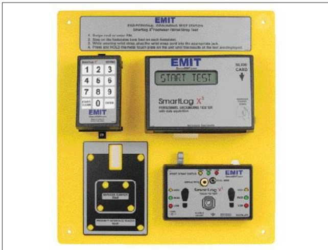
Figure 1. SmartLog X 3 ™