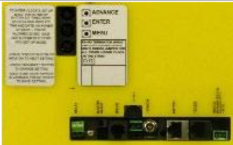
Figure 4. Back-side of SmartLog X 3 ™ plate