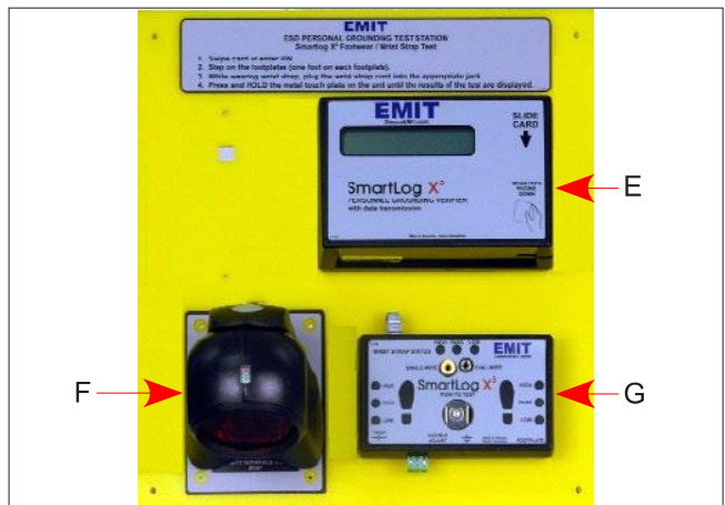
Figure 3. SmartLog X 3 ™ features and components (Items 50734, 50735)

D. SmartLog X 3 ™ Wrist Strap / Footwear Tester: Default wrist strap test range is 1 - 10 megohms. The default footwear test range is 1 - 35 megohms. The default test ranges may be changed to suit personal ground device testing. See Technical Bulletin TB-6564 for instructions.