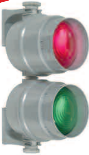
Fixing Bow for (LED) Beacons 890 (Beacon not included in assembly)