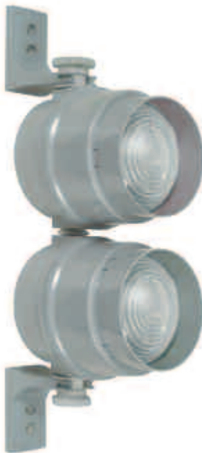
The fixing bow can be mounted pointing inwards or outwards