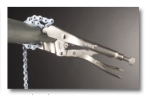
Locking Chain Clamp grips large or irregular-shaped objects effectively, yet minimizes crushing.