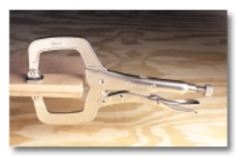
Locking C-Clamps allow quick, easy positioning of workpieces. Swivel tips minimize marring on softer materials.

Crescent brand locking pliers are made to an exacting standard that results in improved durability and long-term performance. In fact, they not only meet the performance of the leading competitor, but also meet stringent ASME standards B107.24 and B107.36, as applicable, for product specifications, including strength and maximum jaw opening capacity. Yet, as strong as they are, Crescent locking pliers still maintain the narrow profile required for work in tight and confined spaces. A full line of locking products is available, including curved and straight jaw pliers, long nose pliers, regular tip and swivel-pad 'C' clamps, cushion grip sets, and more. See the new line of Crescent locking pliers soon wherever true professional quality construction tools are sold.