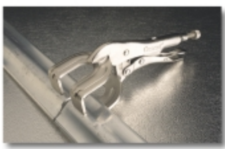
Locking Welding Clamp holds workpieces firmly in position. Open design allows clear access for welding.