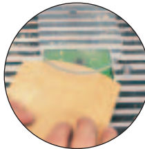
Profiling with Optional Top Guard