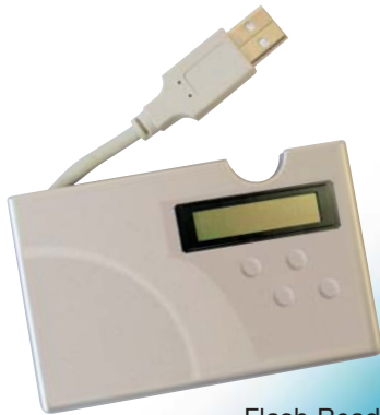
Flash Reader Writer