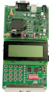
Ordering Information For AT89C5131 Starter Kit Part Number: AT89STK-05