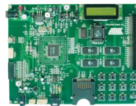
Ordering Information For AT89C5132 Starter Kit Part Number: AT89STK-04