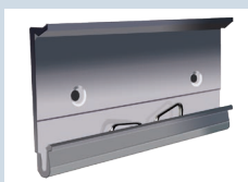
MK-070: Snap-in DIN Clip Kit for 4&8 Port ES/US