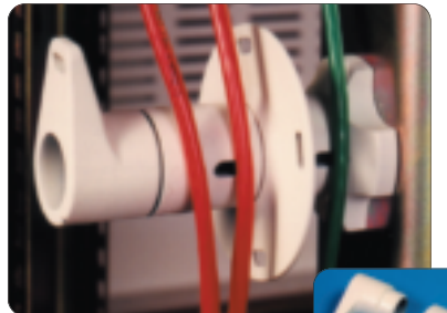
Twist & Lock cable management support arms, end retainers and divider rings.