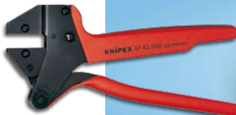
97 43 200 EAN-Code: 4003773030812