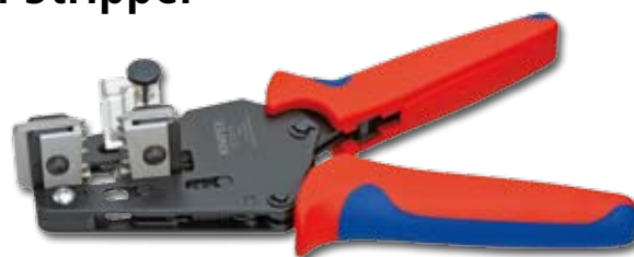
12 12 11