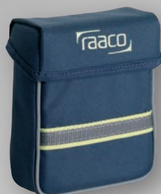
1/4 Pouch w. Cover

For storage of accessories and consumables. Strong clip with lock for secure mounting on Tool Taco.