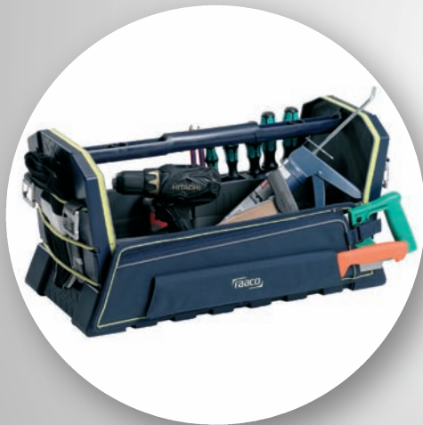
Two pouches available