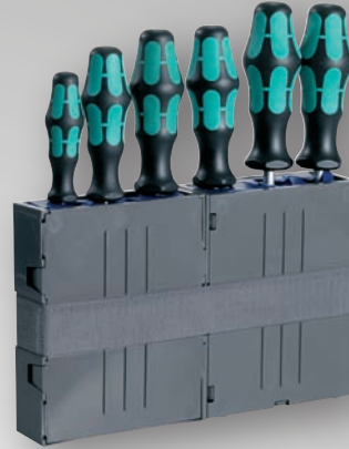
1/2 Tool Fix

Unique efficient holder for tools of any shape or size (max. Ø 30 mm). Strong velcro for mounting inside of Tool Taco and Open Pouch.