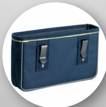
With strong clips for easy mounting on Tool Taco