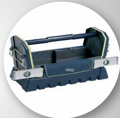
Strong velcro used for fastening