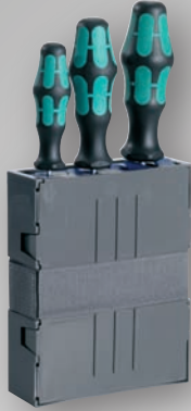
1/4 Tool Fix

Unique efficient holder for tools of any shape or size (max. Ø 30 mm). Strong velcro for mounting inside of Tool Taco and Open Pouch.