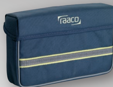
1/2 Pouch w. Cover

For storage of accessories and consumables. With two clips for easy mounting on Tool Taco.