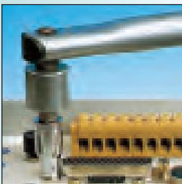
Optional stepless ratchet (Part No. 13122)