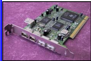
USB & FireWire Combo Host Card (PCI)