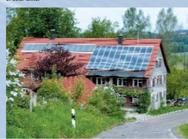
Connected since June 2006: The PV reference system, "Stoiadler III" with 200 modules and 26 KWp of power.

SunCon is the ideal connector system for simple upgrades of solar units.