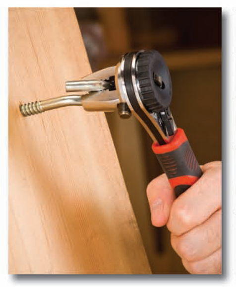
When a task requires many turns of a fastener, the R<sup>2</sup> RapidRench ratcheting feature makes the job quick and easy.

With its 1/4" to 7/8" jaw capacity, it replaces 38 of the most popular socket sizes and works on many different types of fasteners. It's perfect for typical "around the house" projects like working on a lawnmower or a bicycle. And since the R<sup>2</sup> RapidRench is infinitely adjustable, it works equally well on both SAE and metric fasteners.