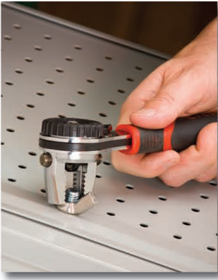
The unique jaw of the R<sup>2</sup> RapidRench makes it one of the most versatile tools ever, since it works with so many types of fasteners.