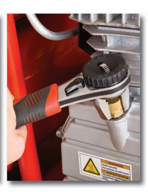
The R<sup>2</sup> RapidRench works on square bolts, hex bolts, J-bolts, hook eyes, wing nuts, thumb screws, and many, many more.