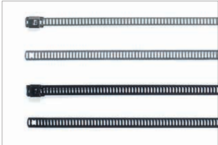
Stainless Steel Cable Ties can be used at temperatures up to 538° C.

The MAT ties are similar in design to conventional 'plastic' cable ties and work on a ratchet system. Available in type 316 stainless steel.