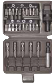
4519 Quick Change bit set 27 piece set