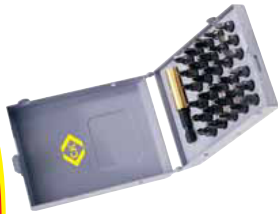
4566 Screwdriver bit set 31 piece set