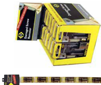
3060 Damaged screw remover Clipstrip & counter box