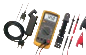
88V/A - Automotive Meter Combo Kit