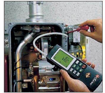
Differential pressure measurement on heating units

testo 312-3, the versatile manometer for the pre-test and main test on gas and water pipelines up to 6 bar. Pressure changes caused by changes in temperature during the measurement are balanced out by the temperature compensation function.