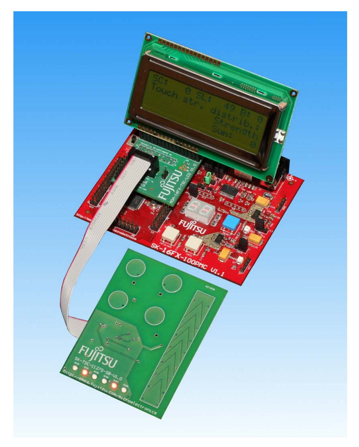
Figure 2: System set-up

(LCD and SK-16FX EUROSCOPE not included!)